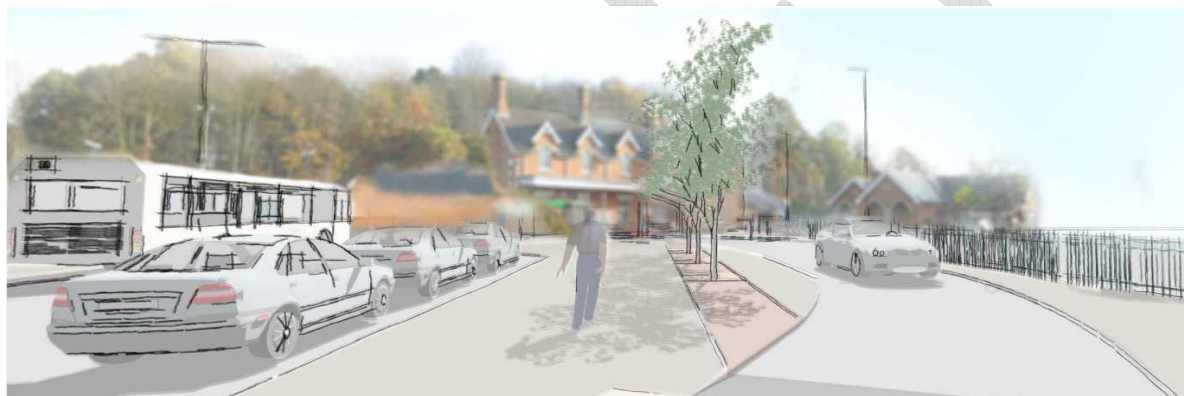
Artists impression of new interchange at West Malling Station

We have been impressed by the willingness of the rail industry to engage with us to promote a current scheme at West Malling Station. The project involves a major remodelling of the forecourt and approach road and we believe this provides a model way of working. Disappointingly, financial contributions from the rail industry and the DfT have been absent. Nevertheless, we are looking to fund works through creative use of Section 106 monies from developments in this area.